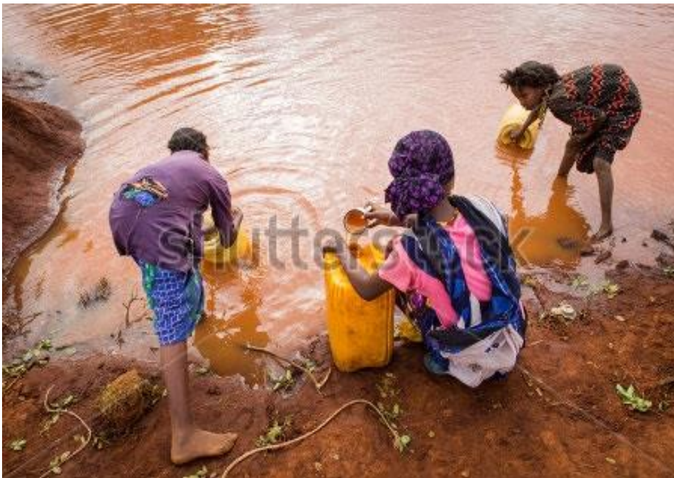
Fig. 5: Young girls collecting water from a stream in Gayo village, Ethiopia