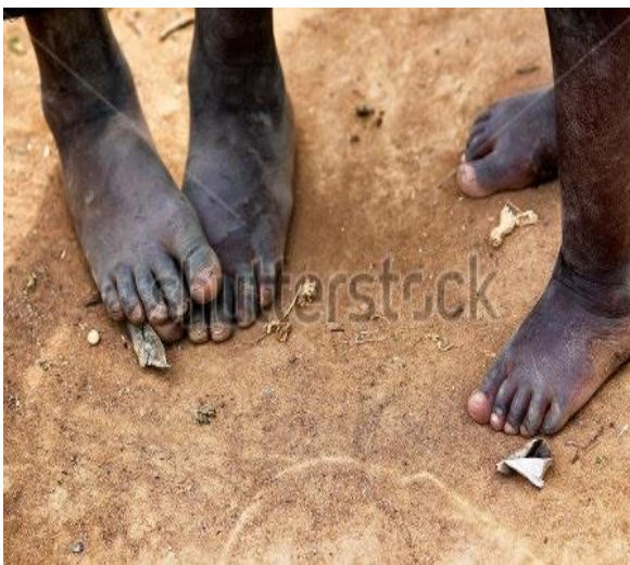
Fig. 6: Guinea worm infected African children in Gayo village, Ethiopia

Sources: 1 – 6 ( https://www.google.com.ng/search?q=Guinea+worm+infected+African+children+in+Gayo+village,+Ethiopia: ).