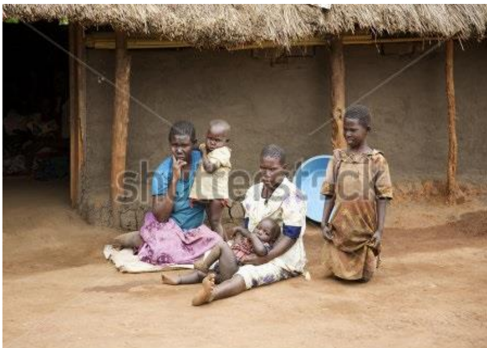
Fig. 3: A Poverty Stricken African Family sitting outside their home in Liberia, Uganda