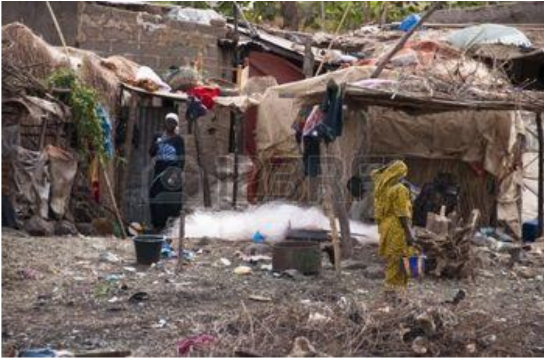
Fig. 4: Bozo Village in Bamako, Mali: Showing A Typical African Home