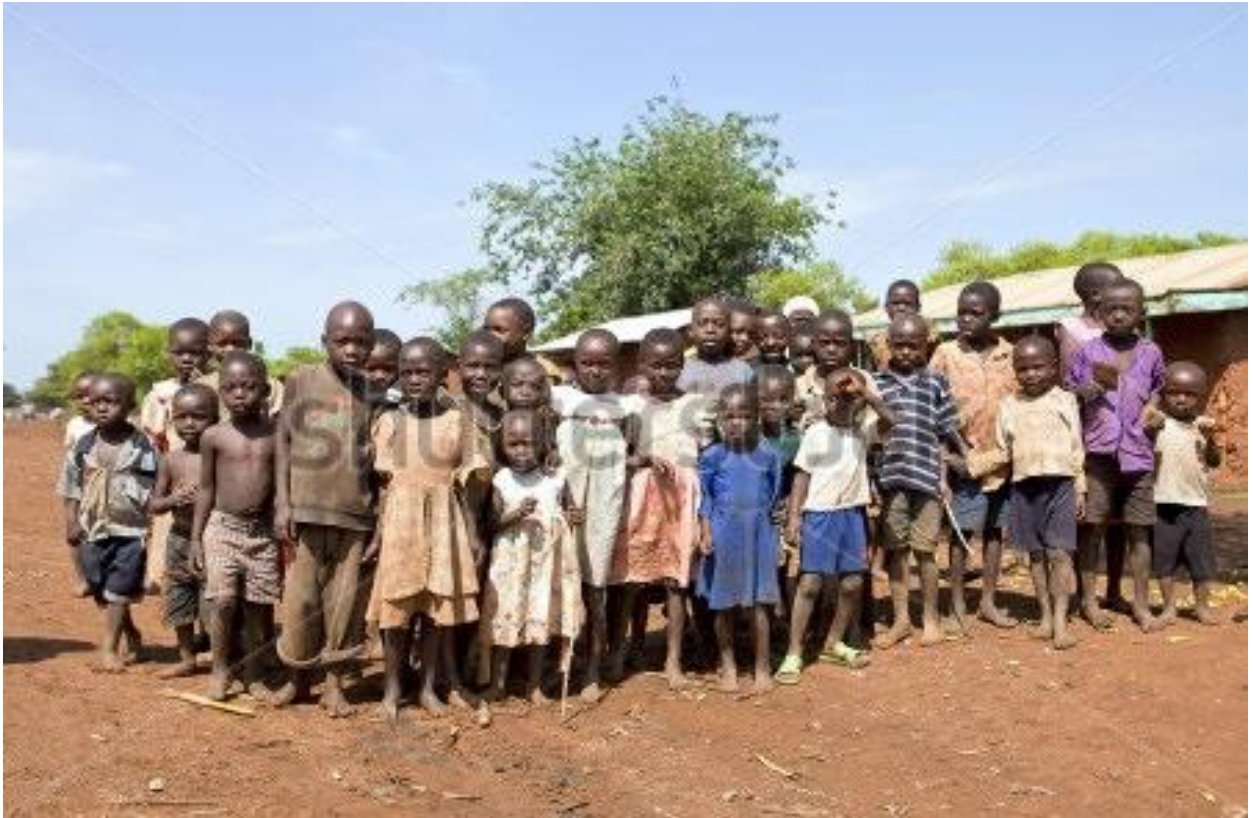
Fig. 2: School Pupils without school uniform