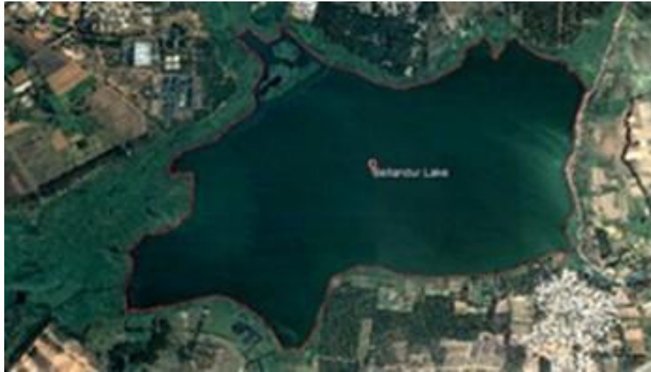
Figure 1. Bellandur Lake image of 2002