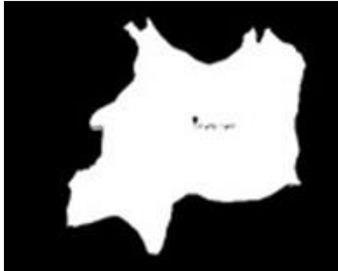
Figure 4. Detection of a water body using HSV color space range