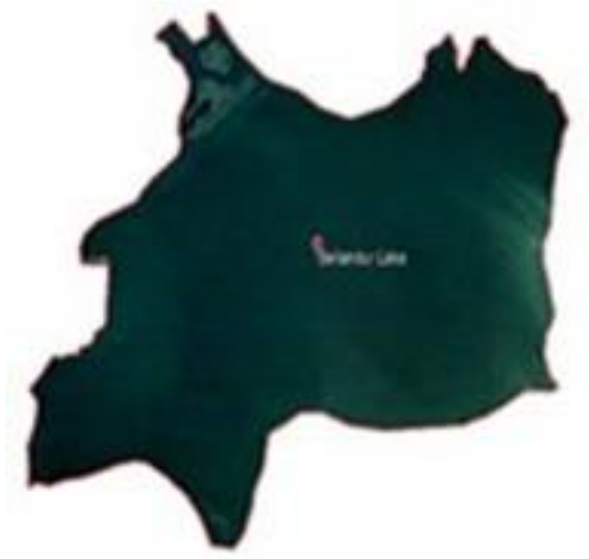
Figure 3. Bellandur Lake trimmed image of 2001

Since we are analyzing the area within the lake. Therefore, we have converted all the pixels into white pixels that belong outside the lake.