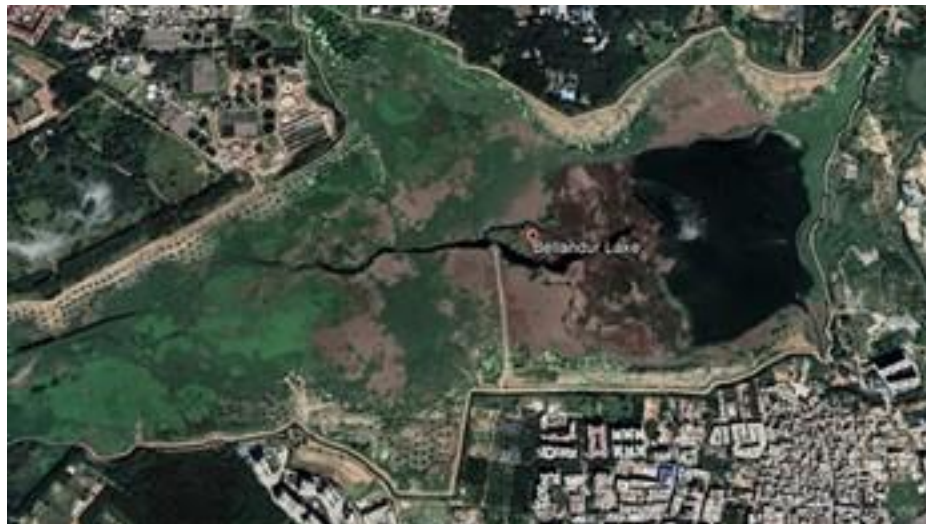
Figure 2. Bellandur Lake image of 2020