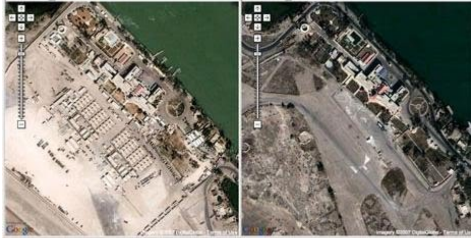
Figure 2 - the British headquarter in Basra (before and after Google's update)

the same place in Basra is however actually older, preceding the Iraq invasion and showing no military installations. Figure 2 displays this change as published in Ogle Earth ( Geens, 2007 ).