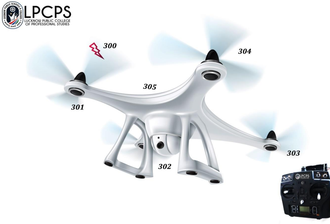
Figure 3: The Drone: Unmanned Aerial Vehicle (UAV).

The robot is utilized for recordings, taking photographs, banner lifting, blossom dropping, and so on. Since it depends on computerized reasoning, it has a Return to Home element-returns to a similar spot from where it took the flight, assuming its battery comes up short. The Drone: Unmanned Aerial Vehicle (UAV) is shown in Figure 3 .