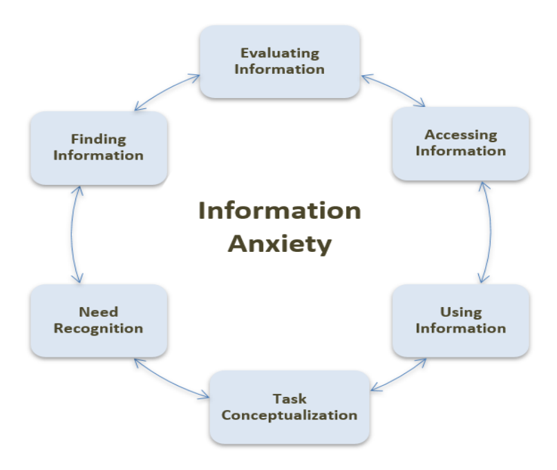
Figure 1. New Framework of Information Anxiety

Information anxiety is a much broader concept embracing information seeking or retrieval anxiety, experienced by anyone, anytime, and anywhere, but including other anxieties associated with certain other aspects of information such as task conceptualization and definition, need recognition, comprehension, synthesis, evaluation, and use of information. It refers to the feeling of discomfort when people interact with information for solving information-based problems in multiple contexts such as academia, workplace and everyday life. Eklof (2013) defined it as "a guilty feeling, as if it is the responsibility of the person to understand all of the information to which he or she has access" (p. 247). These feelings may not only cause different 'cognitive, emotional, and behavioral effects' but may also affect an individual's self-efficacy and performance. This study proposes a new framework of information anxiety that goes beyond information retrieval and information seeking (Figure 1).